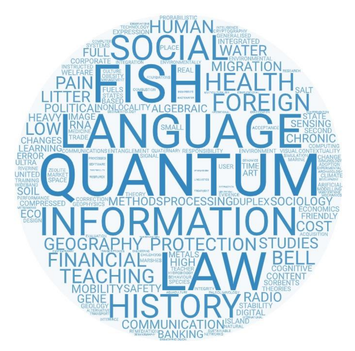
Figure 1 Word Cloud based on current research focus keywords (wordart.com)

To follow up on the selection of the research domain in more specific terms, the participants were asked to list several keywords that are most relevant to their research focus. The keywords are illustrated in the Word Cloud (Figure 1).